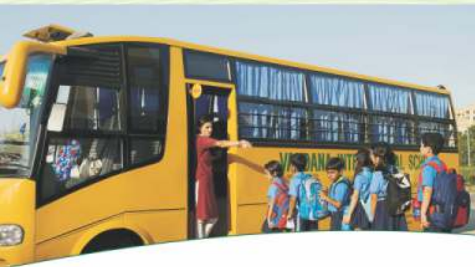
SCHOOL VAN DROP OFF ZONE